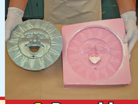
1. Powder Coat